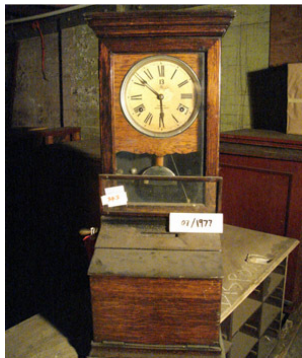
1888 Bundy Clock