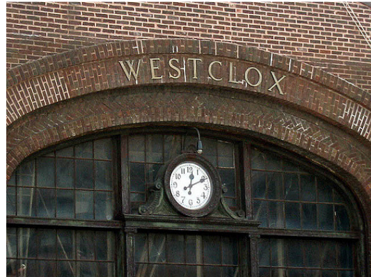
Abandoned WestClox Factory - Lasalle, Illinois