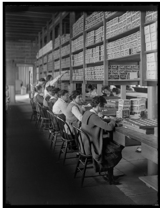
Ingersoll Watch Factory - Circa 1910